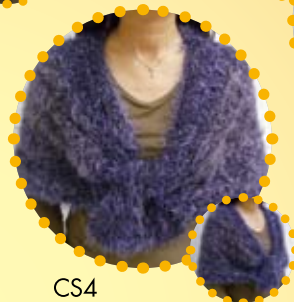
CS4 藍色長毛披肩 Blue knitted shawl (rectangular) HK$180