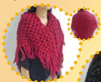
CS1 桃紅鉤針三角披肩 Peach blossom crocheted triangle scarf HK$380