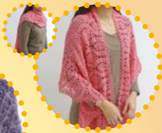
CS5 粉紅鉤針長披肩 (長方型) Hand crocheted shawl (rectangular) HK$1800