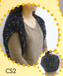
CS2 穿袖毛冷披肩 Fashion hand knitted shawl HK$380