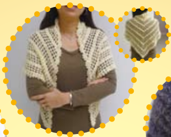
CS3 米白三角披肩 Beige knitted triangle shawl HK$380