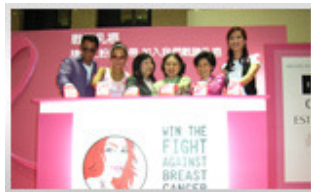
Guests host the lighting ceremony.

Certainly, we cannot miss our Annual Walkathon 2007 at the Peak on 14 October 2007 (Sunday)! Details of the event will be reported in the next E-newsletter.