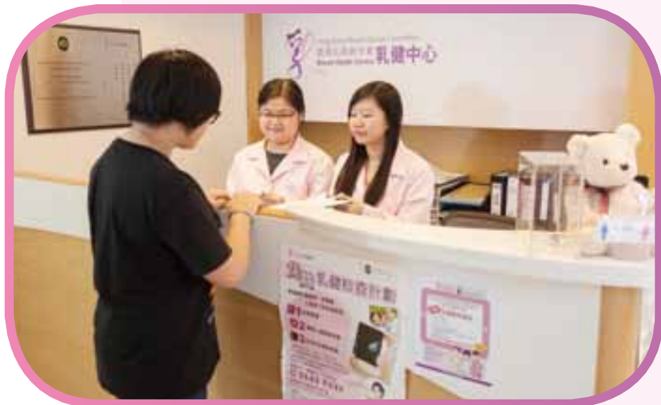
▲ 乳健中心提供乳房檢測服務，以回應本港婦女的需要。

For more information on BHC services please contact 3143 7333.