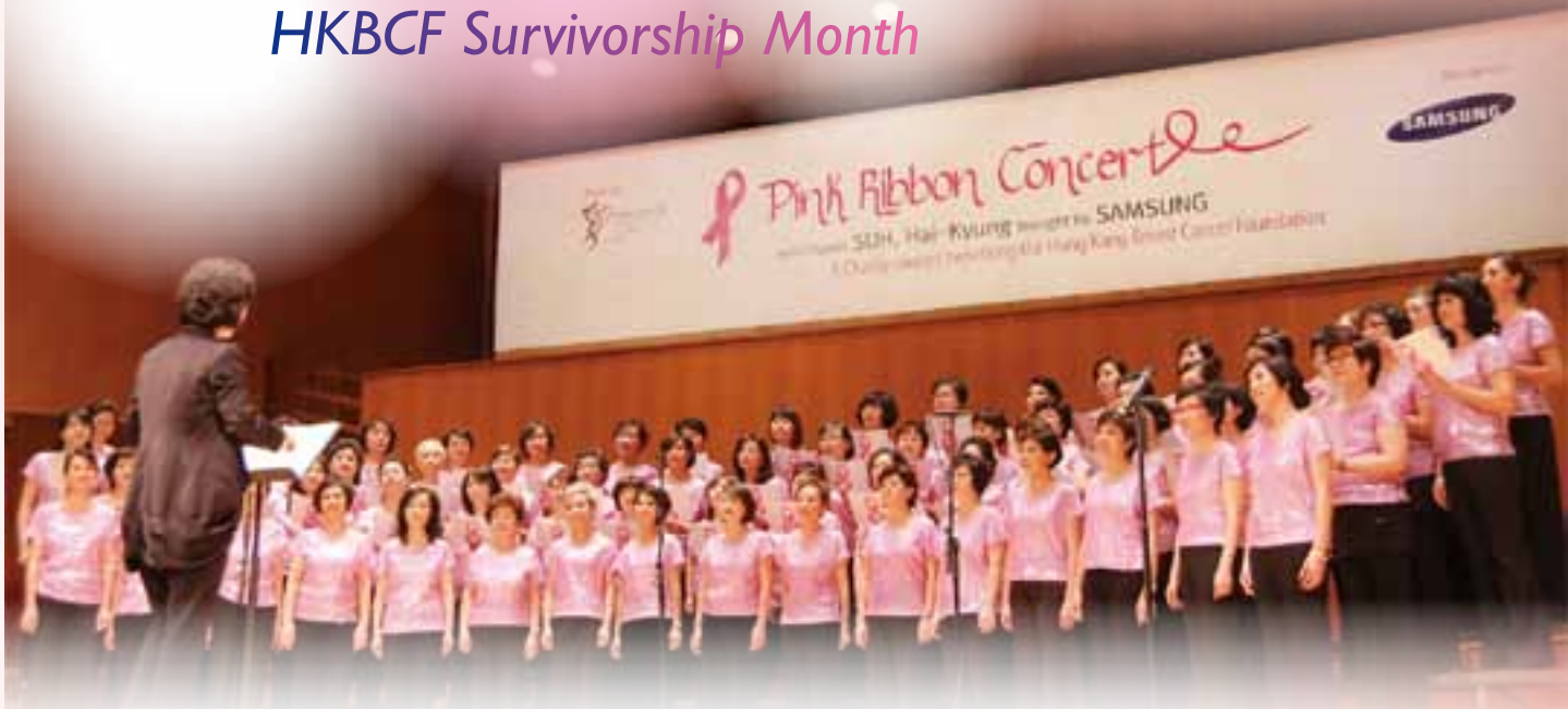
▲ 於《健活麗人生音樂會》中，港韓乳癌康復者攜手送上動人的歌聲。Angelic choral performances at the Pink Ribbon Concert.

香港乳癌基金會宣布將五月份定名為「乳癌康復月」，以肯定所有在抗癌路上積極和勇敢面對的乳癌康復者及家人、朋友和醫護人員，表揚他們堅毅不屈、互相關懷支持的可貴精神。