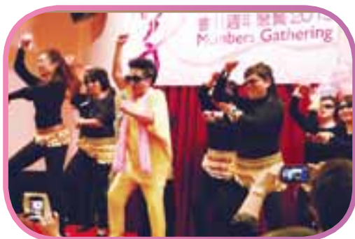
▲ 薛家燕女士與太陽花小組同台跳舞表演。 Nancy Sit danced with the Sunflower group.