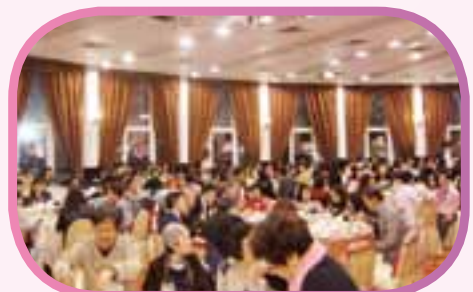
▲ 逾二百六十名參加者共同度過一個愉快及充實的晚上。 260 participants enjoyed a cheerful and fruitful night.