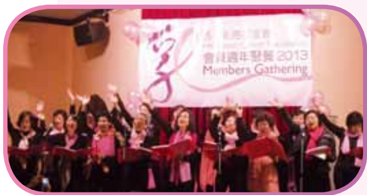
▲ 康復者組成的「音韻樂心靈」獻唱優美的樂曲。 Melody in Mind sang for participants of the Annual Members' Gathering.