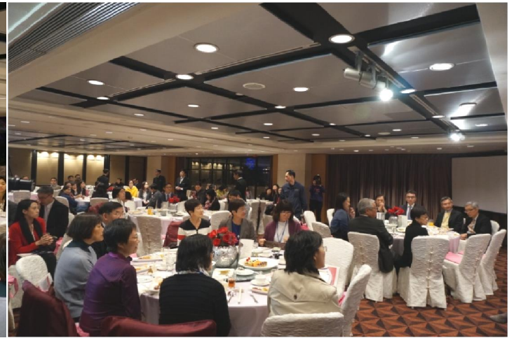
Legislator, District Councilor , Hospital Authority representatives, HKBCF Council Members, HKBCR Donors, HKBCR Steering Committee Members listening attentively to the speakers