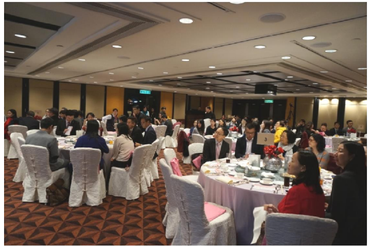
Pharmaceutical company sponsors and NGOs representatives listening attentively to the speakers