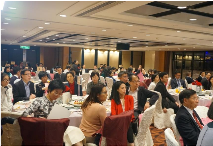
HKBCR Investigators and other doctors from private and public medical institutions listening attentively to the speakers