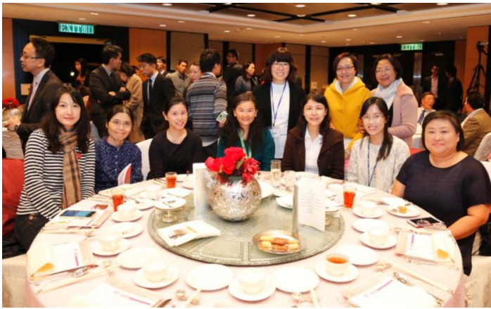
Department of Health of the Government of the HKSAR representatives, Universitiesq representatives, and NGOs representatives